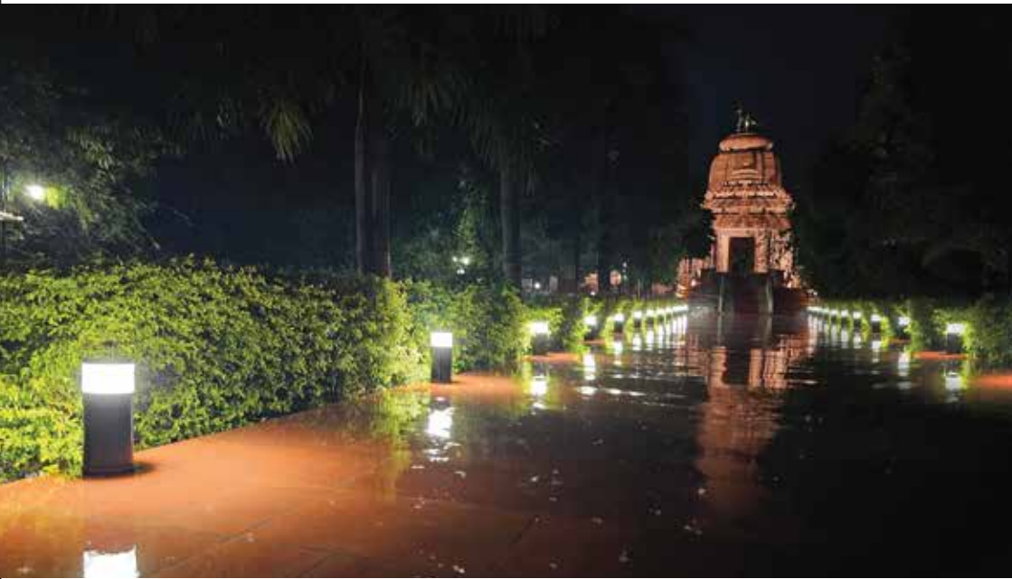
SUN TEMPLE, GWALIOR