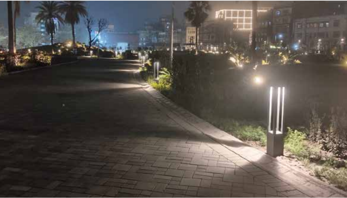
BOTANICAL GARDEN PARK, GUWAHATI