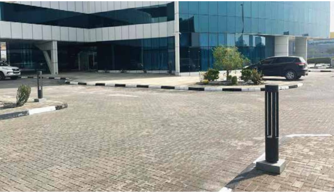
MAKATAB PROJECT, UAE