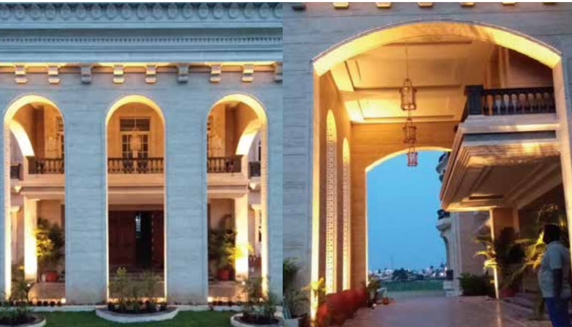
PRIVATE RESIDENCE, CHENNAI