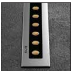
Luminaire supplied with honeycomb louvre

Note : It is our constant endeavor to upgrade the performance of our products. For the latest technical information, IES files and product updates please refer to the website at www.klite.in