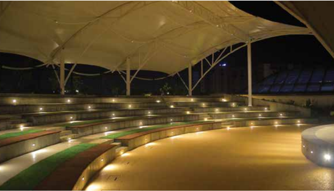
VR Mall, Chennai