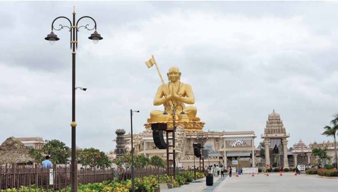
STATUE OF EQUALITY RAMANUJA, HYDERABAD