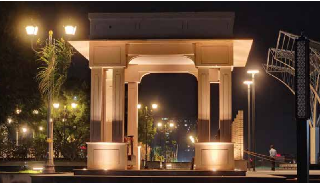
CITY PARK, JAIPUR