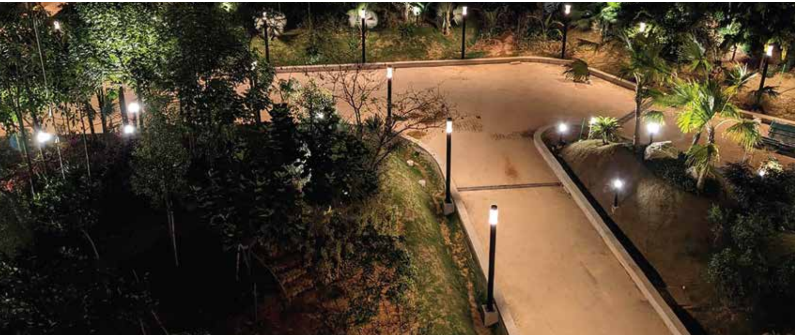
BENGALURU INTERNATIONAL AIRPORT, TERMINAL 2