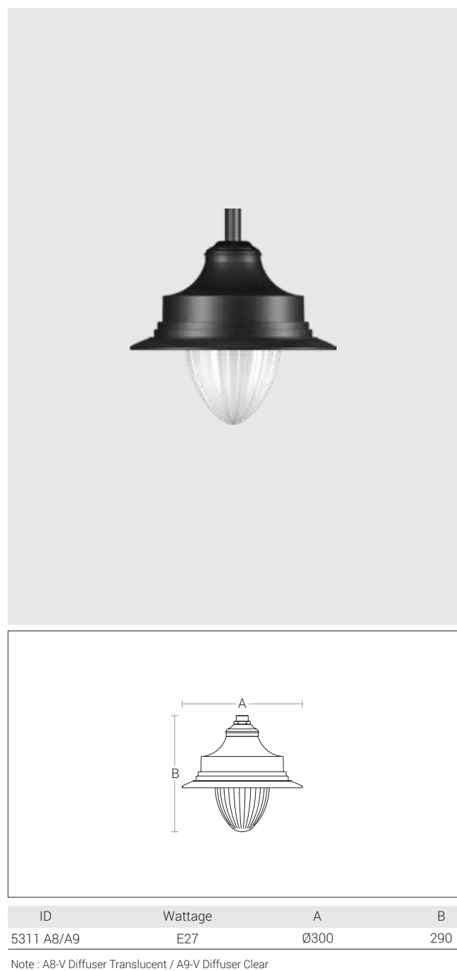
A9 - Clear Acrylic