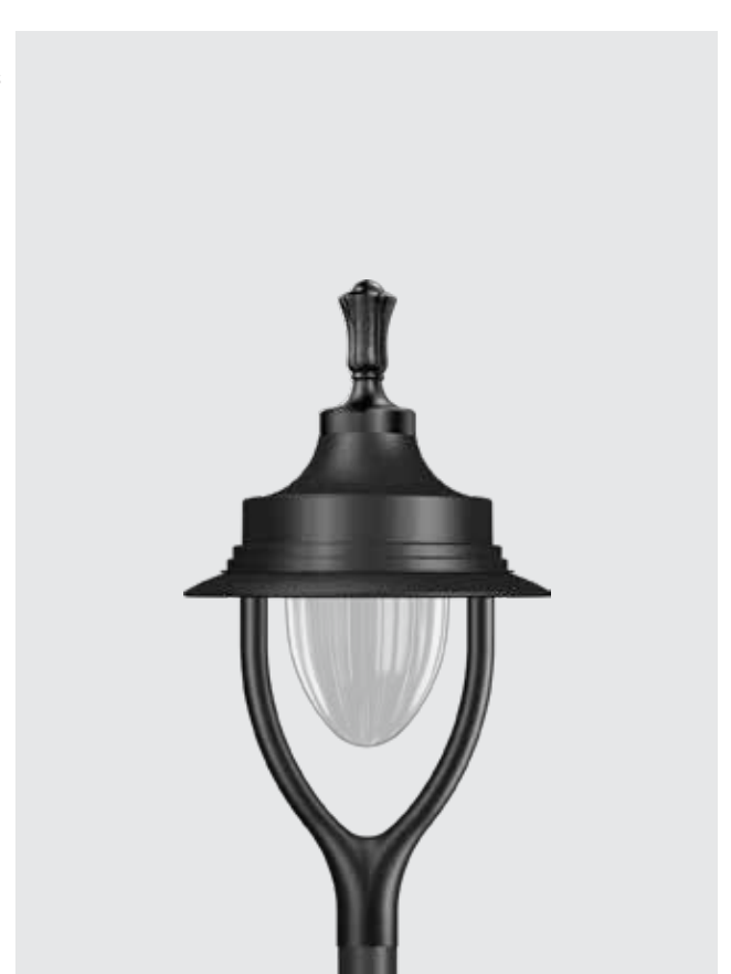
A8 - Translucent acrylic