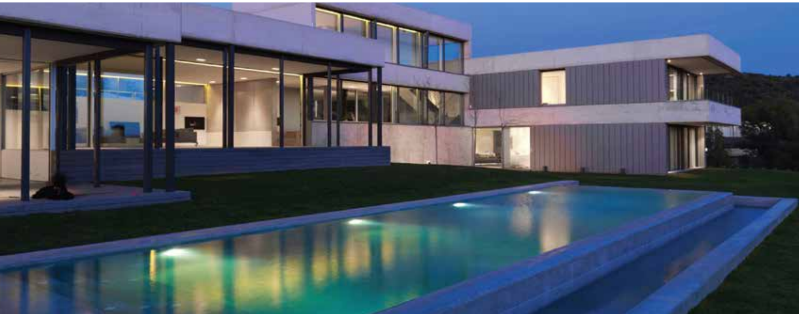
Recessed Pool LED Luminaires