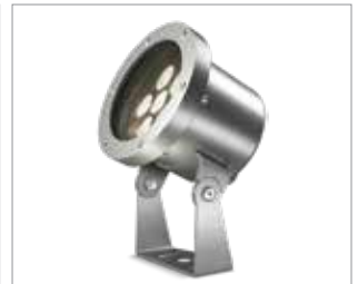
LED Fountain Light