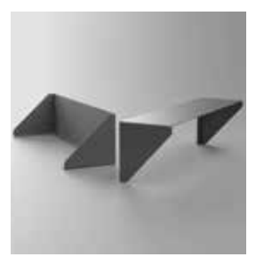
Anti Glare Shield