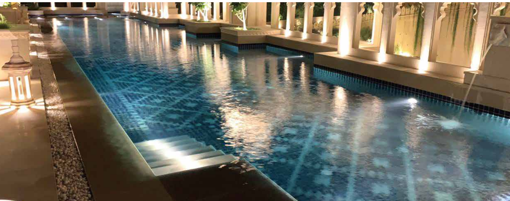
LEMON TREE HOTEL, UDAIPUR