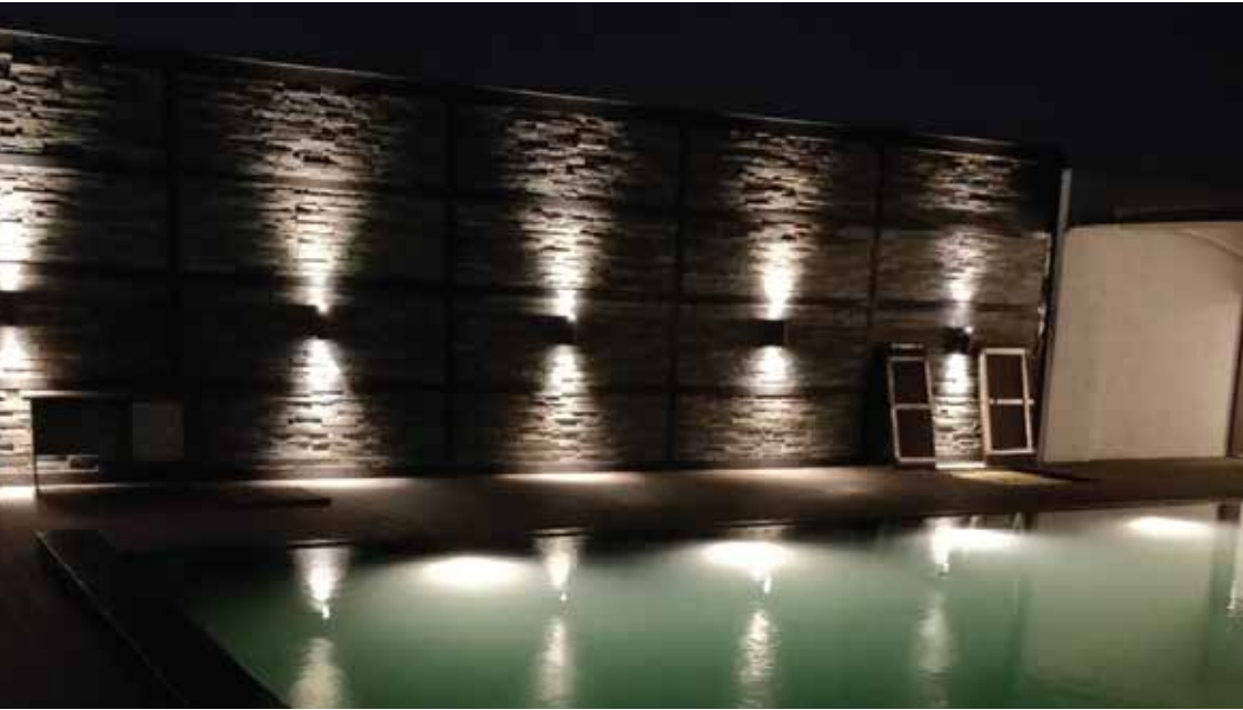
AVM ASTA, CHENNAI