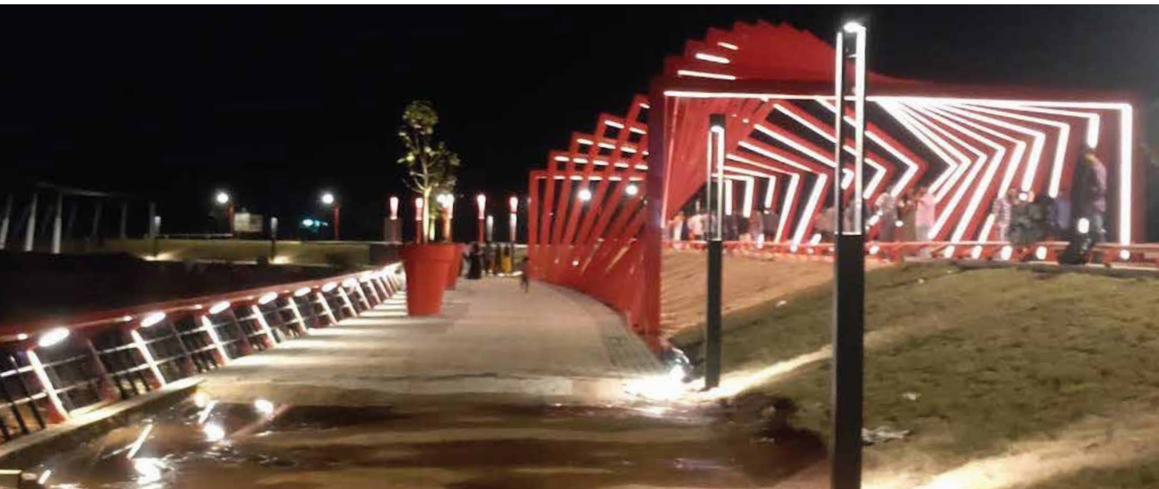
KOMATI CHERUVU, SIDDIPET