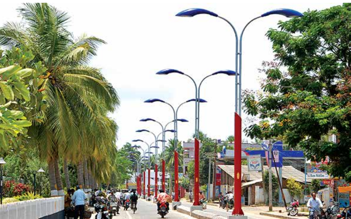
Rajeev Beach Way, Yanam