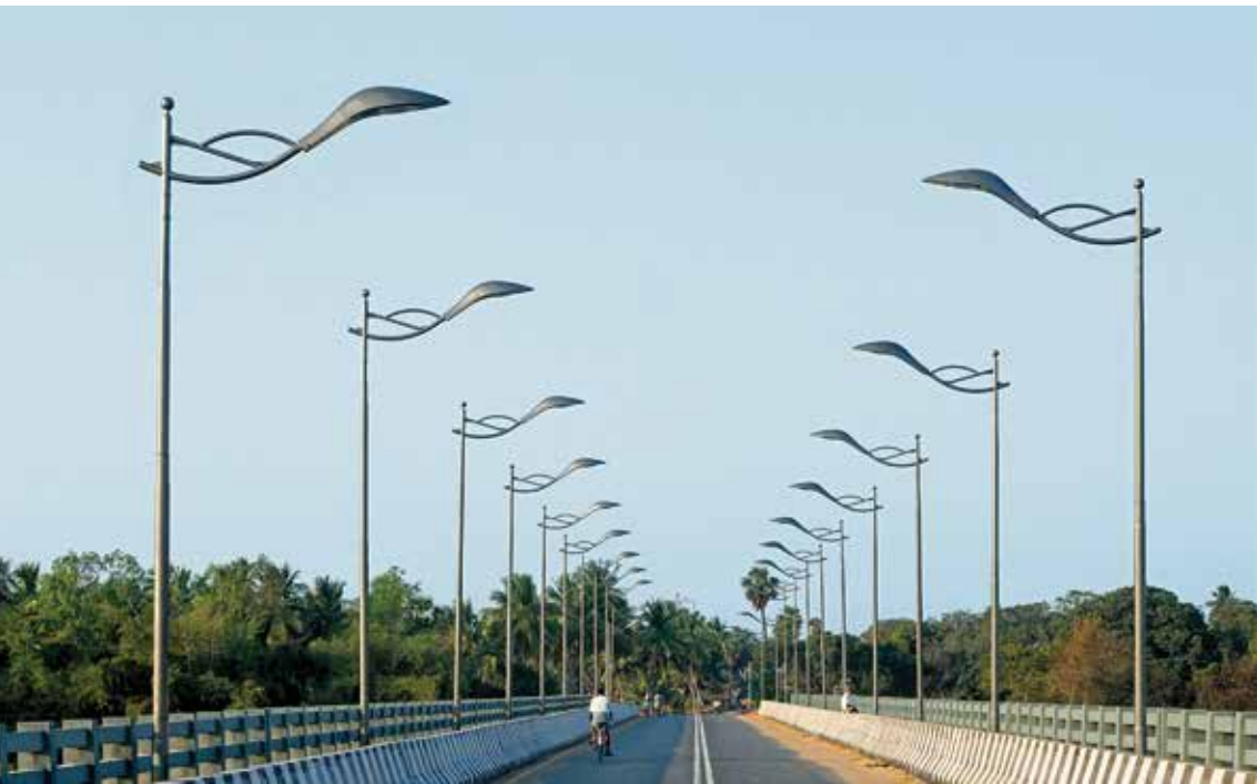
Souriyam Kuppam Bridge, Pondy