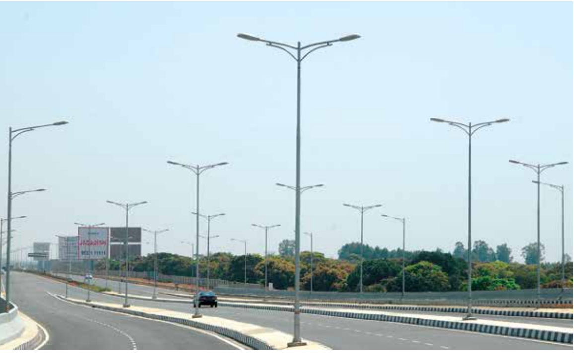
Bangalore International Airport Road